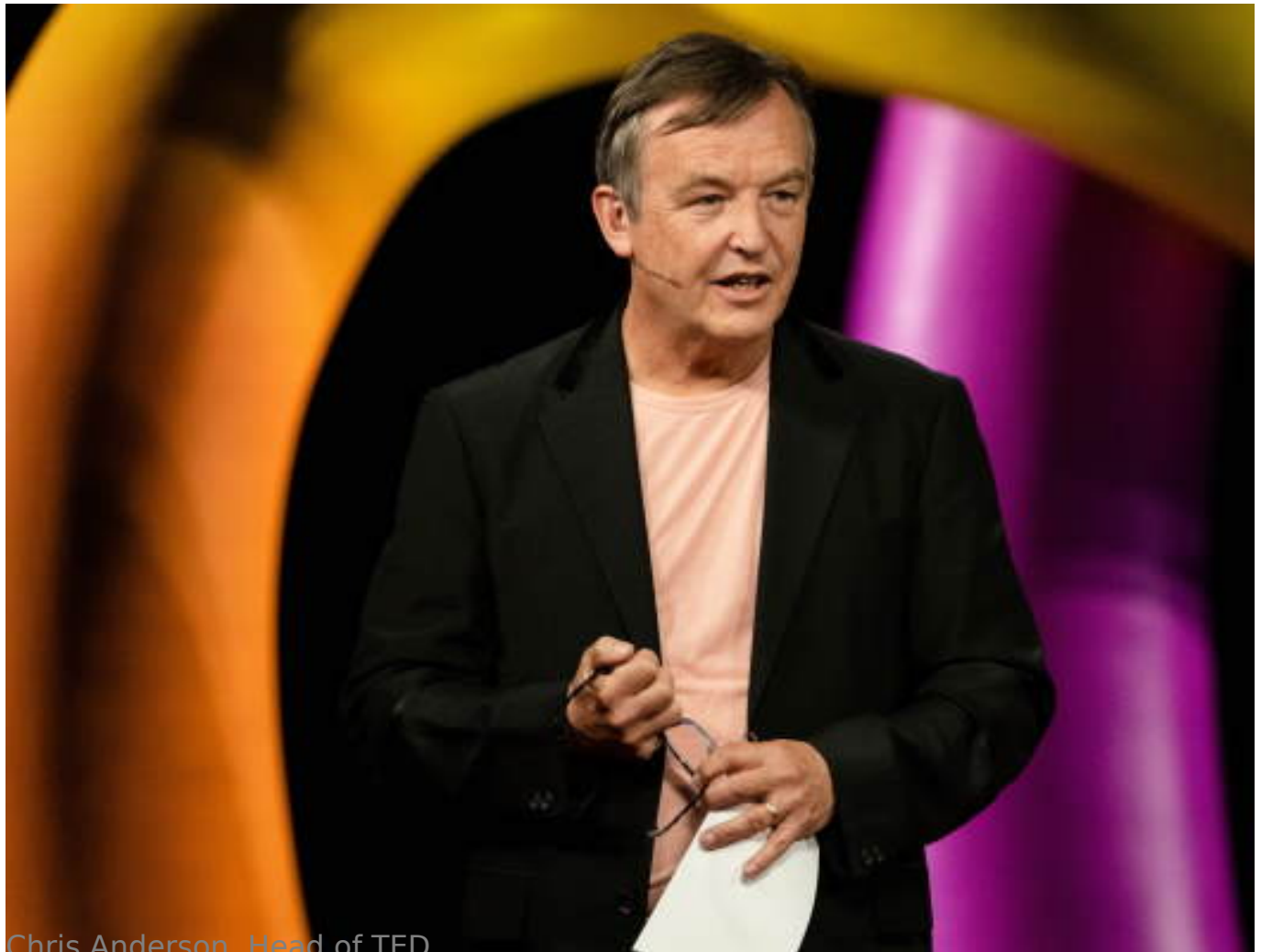
Chris Anderson, Head of TED