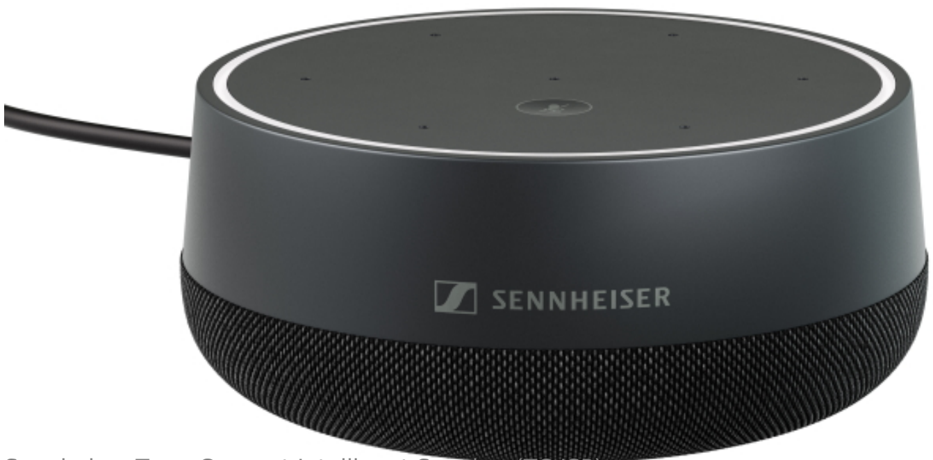
Sennheiser TeamConnect Intelligent Speaker (TC ISP)

Coming off the heels of a strong showing at Integrated Systems Europe in Barcelona, the Sennheiser TeamConnect Intelligent Speaker (TC ISP) will once again be on display, this time at InfoComm. Launched earlier this year, this new addition to the TeamConnect family is certified and optimized for the Microsoft Teams Rooms. Attendees will see the first intelligent speaker from Sennheiser on display at booth W957.