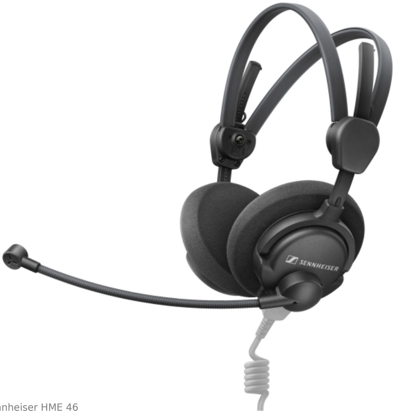
Sennheiser HME 46

Neumann's reference-class audio interface MT 48 will be shown with both the Music Mission for content creation and the brand new Monitor Mission. The latter turns the device into a freely configurable monitor controller and audio interface for stereo, surround and immersive formats. The MT 48 will also be used for demoing Neumann's KH line of studio monitors as well as the NDH 20 closed-back and NDH 30 open-back headphones.